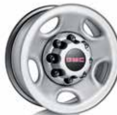
Q85 16" 8-LUG GRAY-PAINTED STEEL STANDARD: 2500/3500 SERIES WT, LS TRIMS