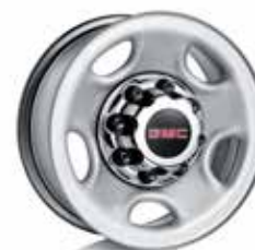
P03 16" 8-LUG GRAY-PAINTED STEEL WITH CHROME CENTER CAP STANDARD: 2500/3500 SERIES LT TRIM AVAILABLE: 2500/3500 SERIES WT, LS TRIMS