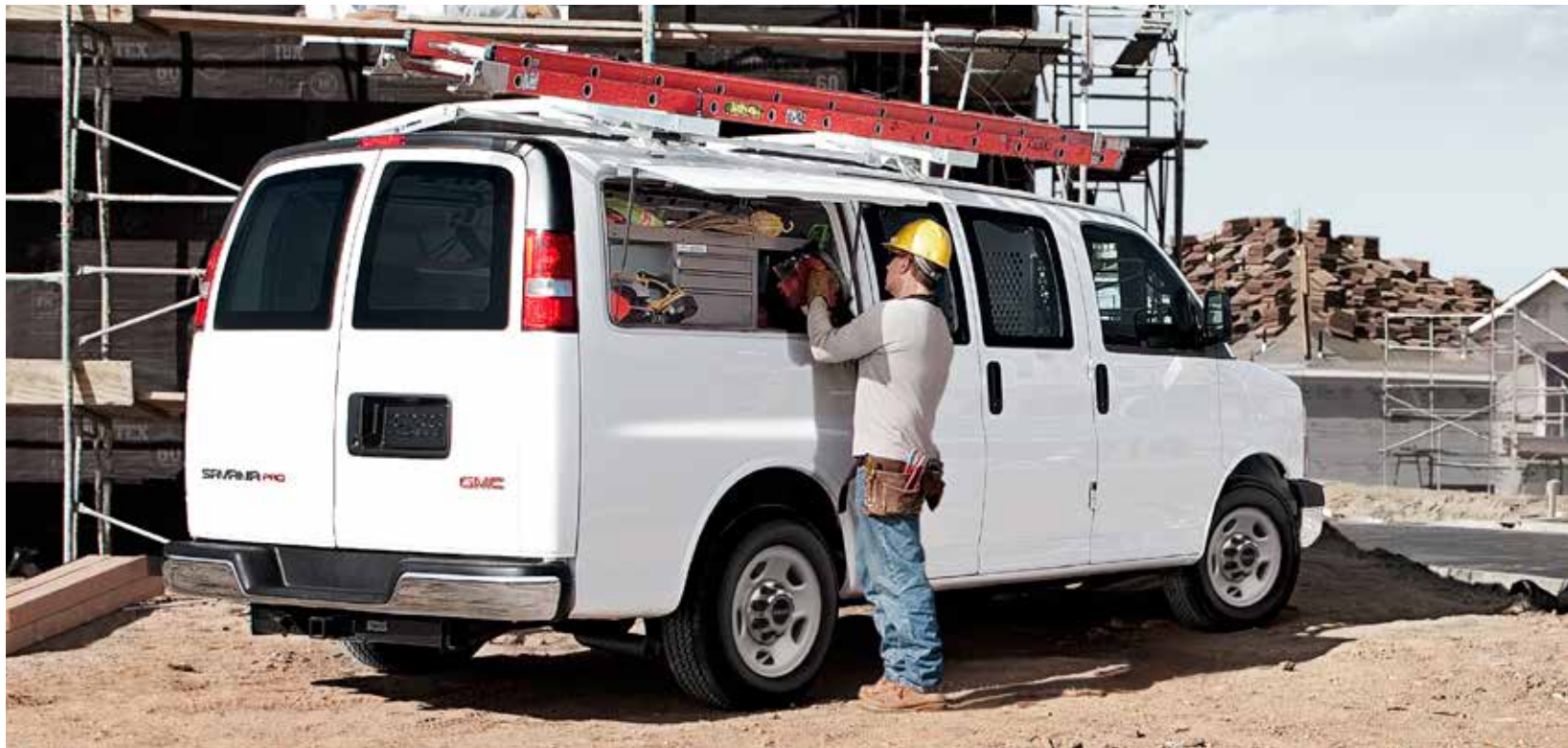
SAVANA PRO PACKAGE Side-access storage bins on the available Savana Pro Package maximize underused areas in standard vans. It provides plenty of cargo space and a flat load floor, so it easily adapts to your needs.

Savana Cargo and Passenger Vans are engineered to make them easy to load and unload with equipment or people. To reduce the effort necessary to access your tools and cargo, both vans offer several laborsaving door options. No matter which one you choose, you'll gain the helping hand you and your crews deserve.