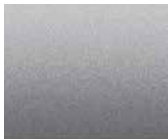
Quicksilver Metallic 2